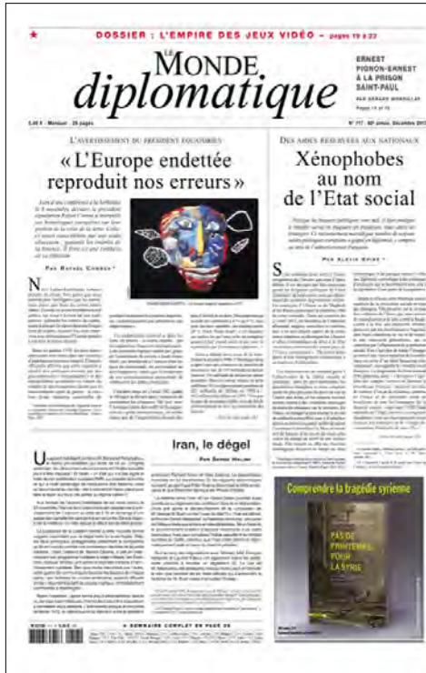
Cover (slightly larger)