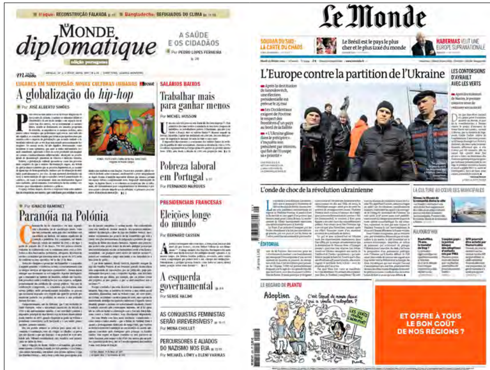
Cover (slightly larger)